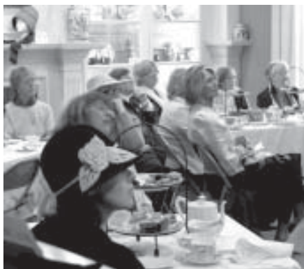
HIGHTEA A Great Time Was Had By All Thank you tea volunteers!!!