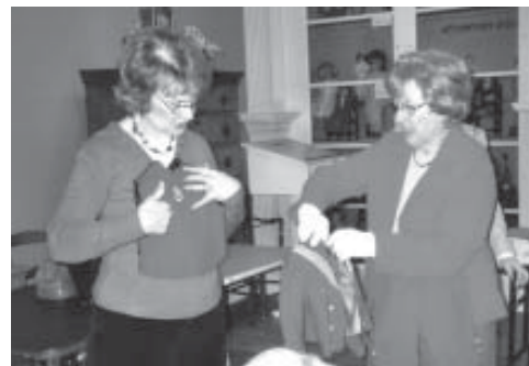
VOLUNTEER DAY Volunteers Are Our Greatest Resource!!!