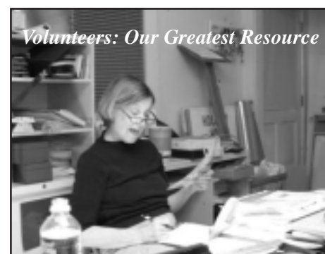
Volunteers: Our Greatest Resource