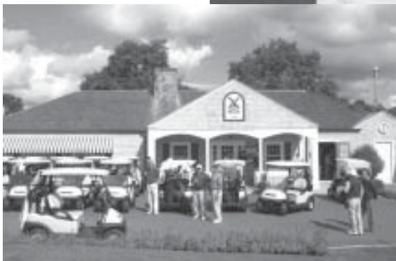
The winning foursome and Starting the day. The 8th Annual CHM Golf Tournament at the Oyster Harbors Club.