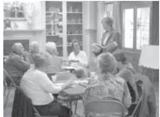
Attentive card players enjoying lessons to update their bridge skills.